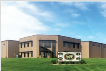
Sioux Falls, SD